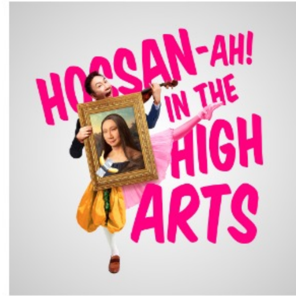
Hossan-AH! In The High Arts